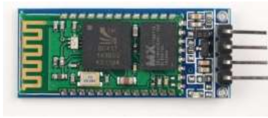
Figure 2: Bluetooth Module