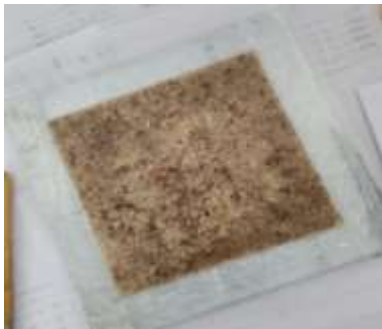
Figure: Mold preparation of 184gms Epoxy + 116gm Hardener + 5gms bamboo + 5gms sugar cane