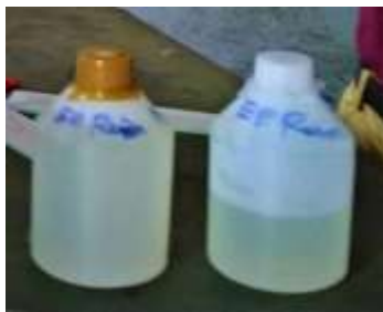
Fig: Epoxy resin

Polyester sap and the impetus Methyl Ethyl Ketone Peroxide (MEKP) were bought from M/s. Sakthi fiber glass Ltd., Chennai, India. 10% of impetus is added with the sap for the amount taken. The are various sorts of filaments the glass strands utilized for the composite creation are introduced in Figure.