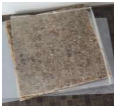
Figure: 184gms Epoxy + 116gm Hardener + 10gms bamboo+10gms sugar cane