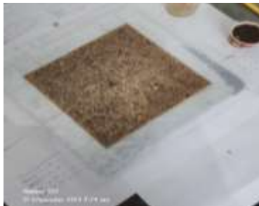
Figure: 184gms Epoxy + 116gm Hardener + 15gms bamboo + 15gms sugar cane