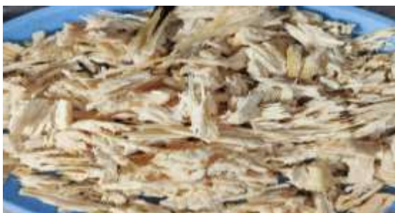
Figure: Sugar Cane Wastage (Bagasse) Fiber

The sugarcane botanical name was also given. Saccharum officinarum is the botanical name for sugarcane. Sugarcane is a grass plant that is in the saccharum genus and the poaceae family. It has been believed to have come from new guinea and been planted in both the subtropical and tropical parts of the country. The plant is also grown for biofuel production, particularly in brazil, because the canes can be directly used to produce ethyl alcohol (ethanol). S.officinarum produces about 70 percent of the world's sugar.