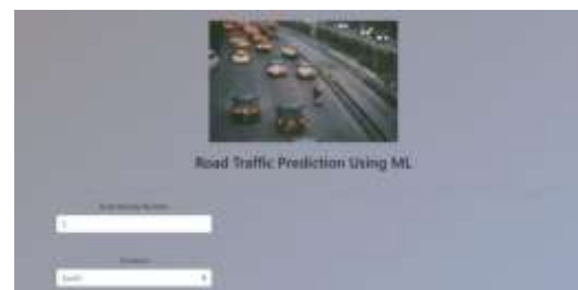
Figure I &II: Page Layout

Java, python and sklearn library are utilized to achieve the paper's goal. The program was designed with a minimal number of buttons so that user can navigate through it with ease. Also the user interface has been kept simple so that the web application can load quickly and without causing any issues for the user.