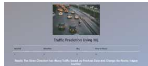
Figure IV: Results