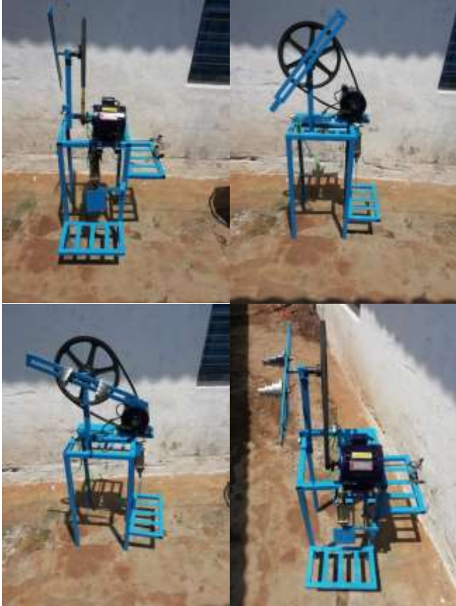
Figure.1 Experimental Works

V. Design and fabrication of a low-cost automatic coil winding and dewinding machine involves a series of experimental work, which can be broken down into the following steps: