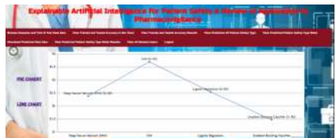
Screen 6: Line Chart