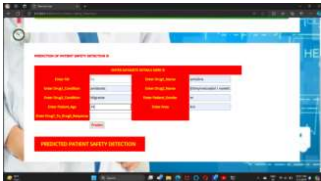
Screen 2: Prediction of Drugs