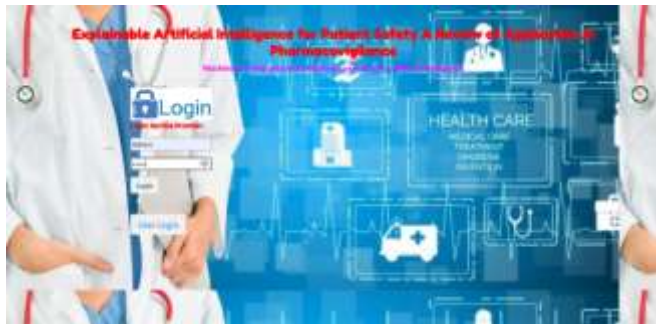
Screen 1:Service Provider Login Page