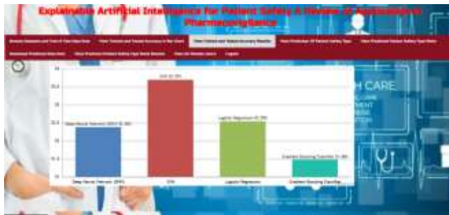
Screen 3 : Chart showing Accuracy using various ML Models