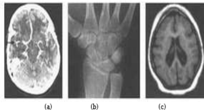
Fig. 2: Examples of (a) CT Scan image of brain, (b) X-ray image of wrist and (c) MRI image of brain

(B) Heart disease identification: Quantitative measurements such as heart size and shape are important diagnostic features to classify heart diseases. Image analysis techniques may be employed to radiographic images for improved diagnosis of heart diseases.