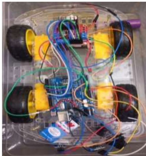
Figure 3: Implementation of Line Follower Robot using Embedded System

A line following robot is a type of autonomous mobile robot designed to follow a specific path marked by a line, usually black on a white surface or vice versa. The implementation of line follower robot involves integrating sensors, microcontrollers, and motor drivers to enable real-time path tracking and movement control.