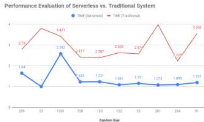
Graph 1: Performance Evaluation of Serverless System