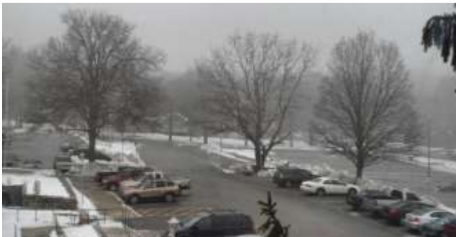
Figure 5: Final image Restored by the proposed method

Step 3: Once the dark channel prior is applied to the image, then contrast limited adaptive histogram equalization is applied to each color channel of the color image independently and final image is restored.