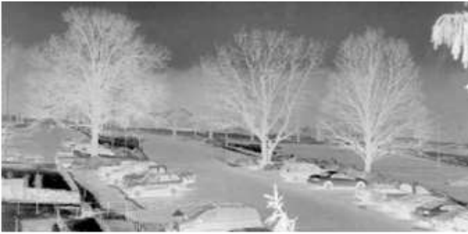
Figure 4: Refined Transmission map

(b) Haze free image is restored using below equation