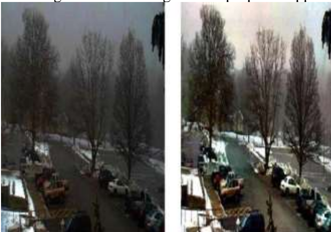
Figure 6 (a) Restored Image by Existing Method (b) Restored image by proposed Method

In this section we will compare the results of the images by the existing and the proposed approaches. The images of the existing and the proposed approaches are shown as under.