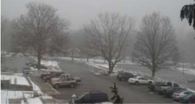
Figure 1: Input hazy Image

Step1: First of all , a hazy image is passed to the system.