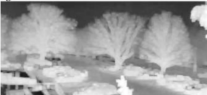
Figure 3: Transmission map

Where t is transmission map, w is the weighted map, D is dark channel original, A is the atmospheric light.