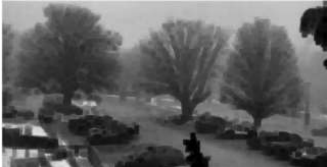
Figure 2: Original Dark Channel Measured

(a) Firstly, the dark channel of the hazy image is calculated.