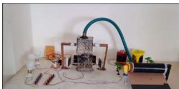
Figure3: The working model of proposed electricity generator from waste material

The project initiates with the collection and segregation of waste materials from various sources. These materials are then introduced into an incineration unit, where they undergo pyrolysis at elevated temperatures, yielding thermal energy. This thermal energy is harnessed by a heat recovery system, which converts it into high-pressure steam or hot water. The steam or hot water is subsequently utilized to drive a turbine or reciprocating engine, generating electrical power. Advanced emission control technologies, such as scrubbers and electrostatic precipitators, are deployed to mitigate pollutant release and adhere to environmental standards. Post-combustion, the residual ash is processed and disposed of in accordance with regulatory guidelines. Continuous real-time monitoring and process optimization are implemented to ensure operational efficiency and minimal environmental impact. The project effectively transforms waste into electrical energy, thereby facilitating sustainable power generation while addressing waste management issues. The prototype model of the proposed electricity generator is illustrated in Figure 3, with detailed descriptions of its operational components provided below.