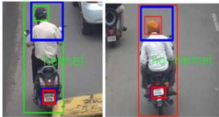
Fig.3. The proposed method for detecting helmeted and non-helmeted motorcyclists.

In order to generate a report and penalize for non-helmeted motorcyclists, the system recognized their license plates, as shown in Fig. 4. And in Fig. 5, a warning message is created for riders who are not wearing helmets..