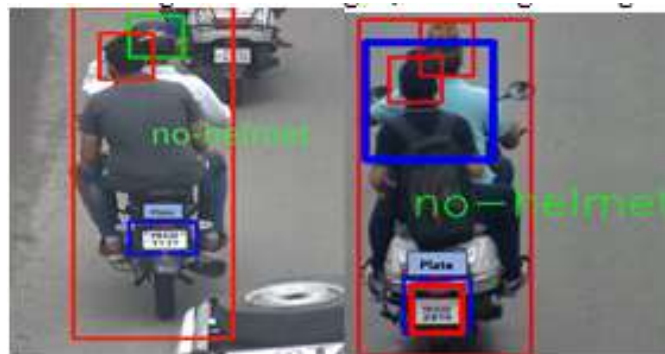
Fig. 4. Number Plate detected for non-helmeted motorcyclists.

In order to generate a report and penalize for non-helmeted motorcyclists, the system recognized their license plates, as shown in Fig. 4. And in Fig. 5, a warning message is created for riders who are not wearing helmets..