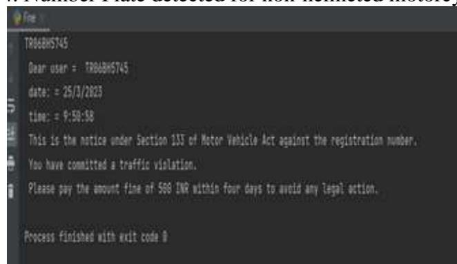
Fig.5. Message generated after number plate extraction for a particular rider who is not wearing a helmet.