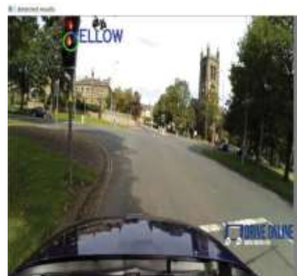
FIGURE 1: The Red Color Traffic Signal is Detected. FIGURE 2: The Yellow Color Traffic Signal is Detected.